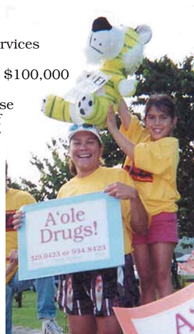
A family affair: Sign waving in Waimea

North Hawaii Women and Children's Services: 885.9318 or NHWCS@aol.com