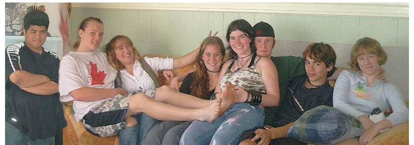
Kahua Program: After-school Teen Theatre Program

Triple "T" TRUTHS Teen Theatre celebrated National teen pregnancy prevention month in May by performing their original production of "Reality Check--Now You Know" at three Big Island High Schools and at the Honokaa People's Theatre. "TRUTHS" stands for "Teaching Responsibility and Understanding of Teens' Health Sexuality" and is a production, written by the teen actors themselves, which addresses the issues of teen pregnancy and pregnancy prevention, relationships, communication, abstinence, sexually transmitted diseases and healthy choices. The play was very well received by students, teachers, and